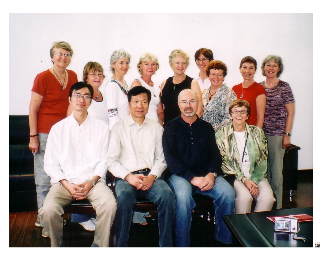
The Shanghai Qigong Research Institute the 2006 group