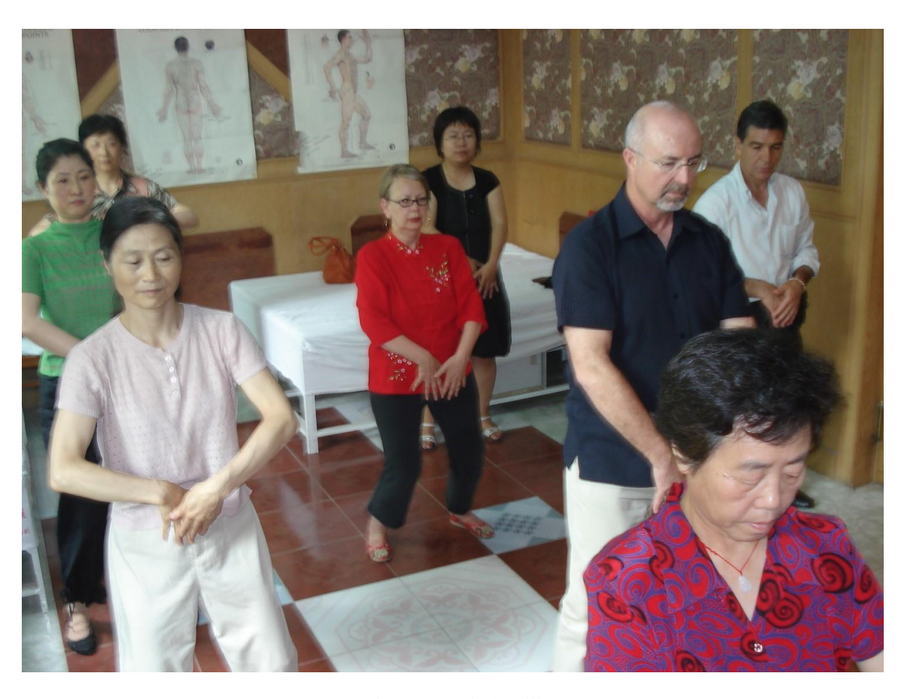
Xiyuan Hospital Beijing 2010