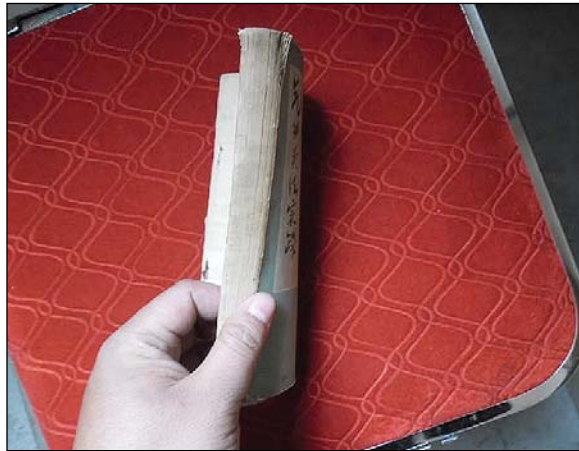
Qigong Therapy Practice - binding