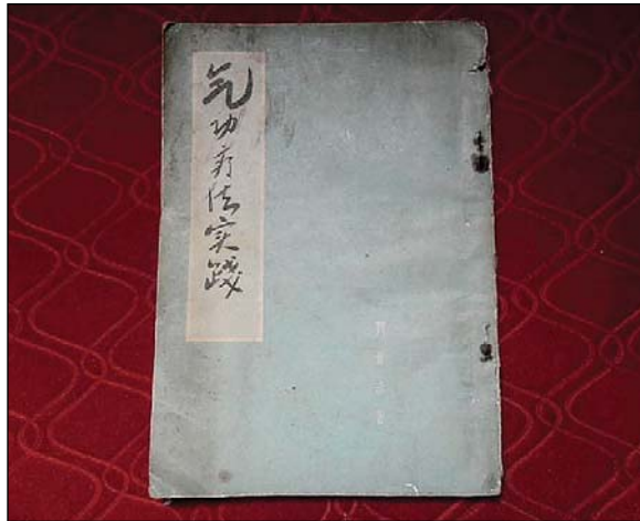
Qigong Therapy Practice - cover